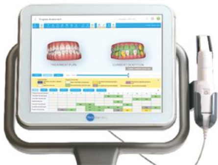
iTero Element Intraoral Scanner with Invisalign® 3D Progress Tracking